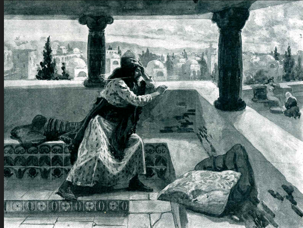
David Sees Bathsheba Bathing Tissot