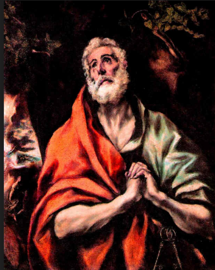
Peter's Remorse El Greco