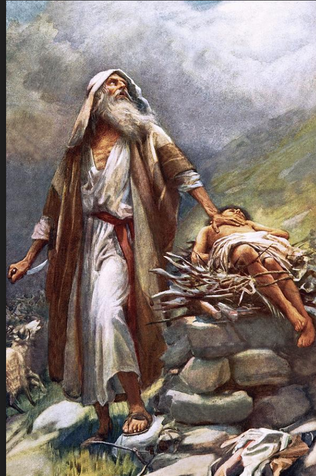
Abraham and Isaac Harold Copping