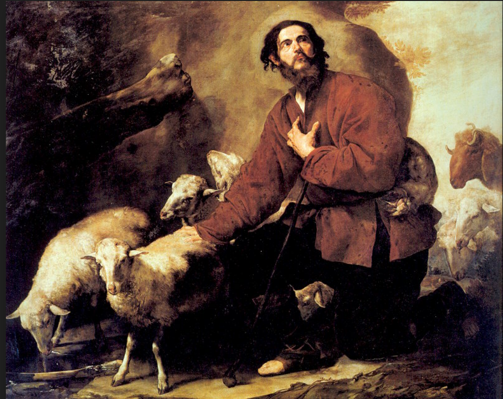
Jacob with the flock of Laban Jusepe de Ribera