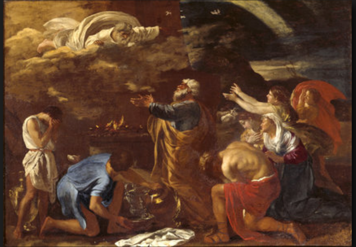
The Sacrifice of Noah Nicolas Poussin